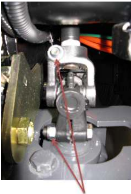
Steering column U/J pinch bolts

The replacement nut and bolt must be of a 10.9 grade, and torqued to 50Nm. This torque should then be checked during the routine six weekly maintenance checks.