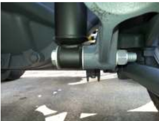
Nut and bolt