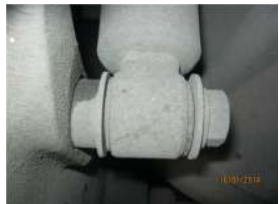
Beam tapped hole

Please note: Either bolt type could have been used in the mounting of the shock absorber so it is important that the correct identification is made.